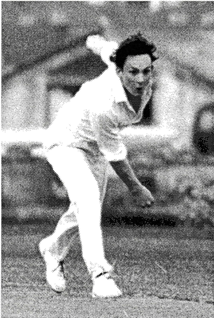
Charlton delivering his seamer

As the shadows lengthened across the gathering of grilled girls on the boundary the talk fell to famous victories on another day and which pub to go to long before Aural were all out for a dismal 48.